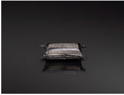
Miniatur-Nähkissen | Miniature Sewing Cushion