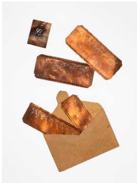
Stickereischablonen | Embroidery Stencils, © Draiflessen Collection, Mettingen, Foto | photo: Henning Rogge