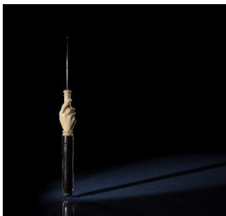
Tamburiernadel | Tambour Needle