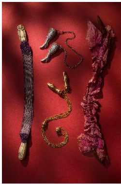
Stricknadelschützer | Knitting Needle Guards