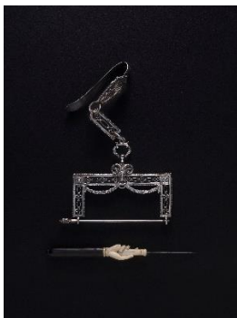
Garnrollenhalter und Tamburiernadel | Embroidery Hoop and Tambour Needle