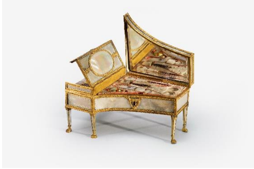
Nähchatulle | Sewing Casket,