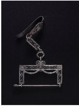
Garnrollenhalter | Embroidery Hoop