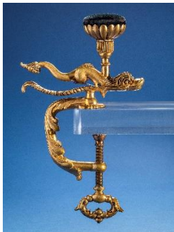
Tischzwinge mit Nadelkissen | Table Clamp with Pincushion