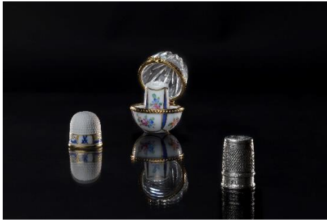
Fingerhüte | Thimbles, © Draiflessen Collection, Mettingen, Foto | photo: Henning Rogge