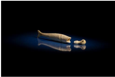
Nadelbehältnis mit Stanhope-Linse und Mikrofotografie | Needle Container with Stanhope Lens and Microphotograph