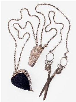
Châtelaine mit Schere und Nadelkissen | Châtelaine with Scissors and Pincushion, © Draiflessen Collection, Mettingen, Foto | photo: Henning Rogge