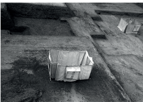
Heidi Bucher, Hautraum in der Grube, Ahnenhaus, 1980, Dokumentationsfoto von Heidi Buchers Häutungen im Ahnenhaus (Obermühle, Winterthur)