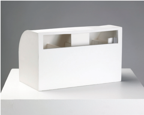
Absalon , Cellule n°4, 1991, Pappe, weiße Farbe, 24,5 x 40,6 x 21,1cm, Centre national des arts plastiques, Im Depot des [mac] musée d'art contemporain, Marseille (Inv.-Nr. FNAC 94247 ) © Estate Absalon / Cnap, Foto: Yves Chenot